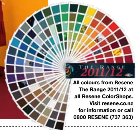
All colours from Resene The Range 2011/12 at all Resene ColorShops. Visit resene.co.nz for information or call 0800 RESENE (737 363)