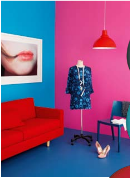
All colours from Resene The Range 2011/12. Resene 'Bowie' (left wall), Resene 'Smitten' (right wall) and Resene 'Limitless' (floor), resene.co.nz

NEW LOOKS Resene The Range 2011/12 is full of clean, uncomplicated colour.