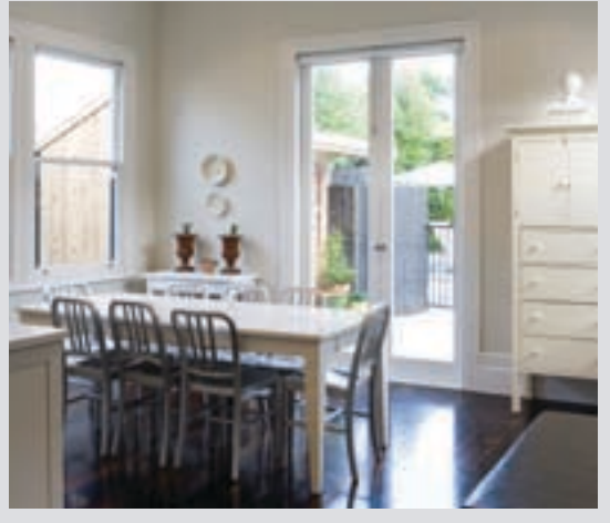
Λ The walls are in Resene Double Tuna, the trims are Resene Alabaster and the ceiling is Resene Double Alabaster.