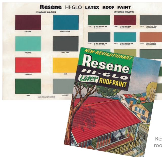
Resene's first roof colour chart.

It was always an original and progressive brand. When everyone swore by white in 1969, Resene pioneered the development of coloured paint bases.