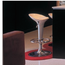
Barstools: Sunny Furniture

Get this interior look with Resene Sandspit Brown and Resene Diesel.