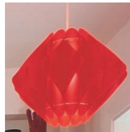
Red lampshade: Iko Iko