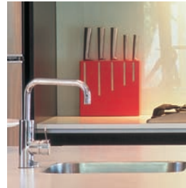
Benchtop: Sheer Mesh natural finish laminex

“We absolutely love it, and we get so many comments about it. The whole design just works really well.” H