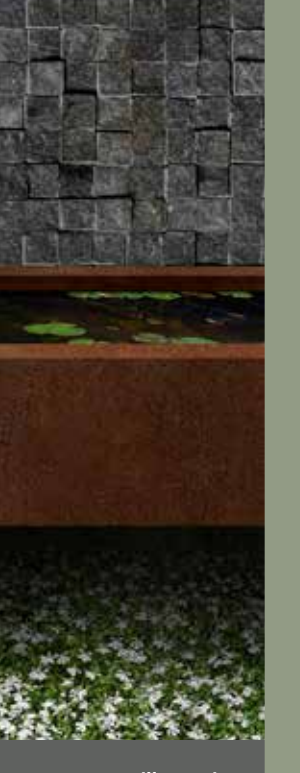
illustration Malcolm White