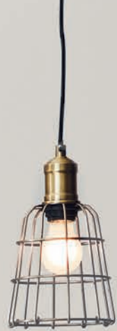
○ Resene Half Tea