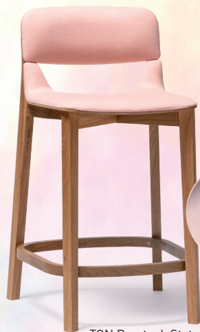
Resene Vanilla Ice

Pastels are less saturated than primary colours and offer a calm, soft, light feeling. The dreamy tones can take you back to simpler times, helping us escape from reality and colour-up a gloomy day.