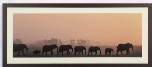
Elephants National Park Kenya, Trenzseater