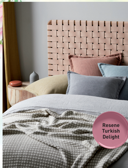
Resene Turkish Delight