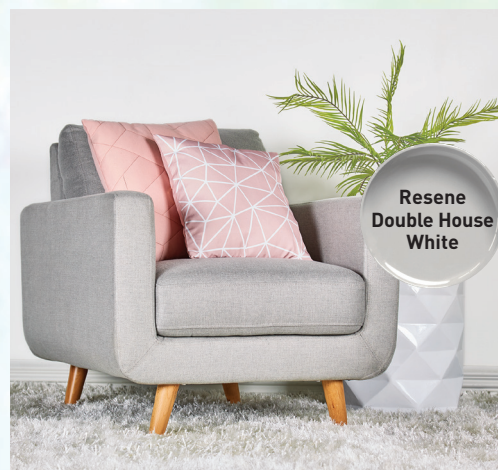
Resene Double House White

The Vinnie chair is upholstered with a gentle washed-out grey pastel, reminiscent of Resene Double House White. Furniture covered in neutral tones has a smart look, and with the addition of pastel coloured cushions acting as an accent this simple and