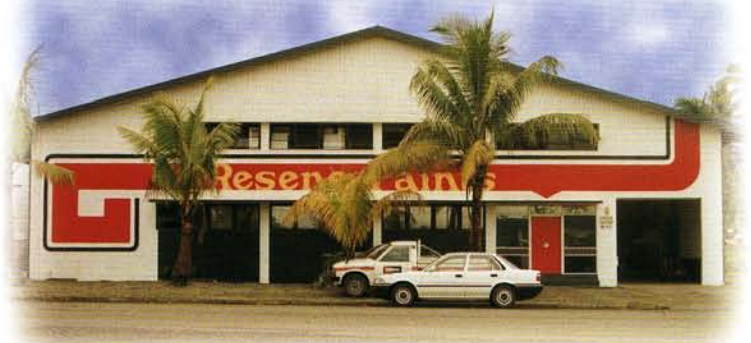
Resene Paints Fiji Limited in Suva manufactures a full range of architectural, industrial, marine and automotive coatings as well as furniture lacquers for the trade and retail customer.

removal of lead from decorative paints in the late 1960s. In 1996, the company continued its pioneering role into manufacturing "green" paint with the launch of New