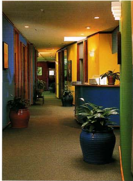
Strong colours typify the interior spaces at Resene Paints Head Office.