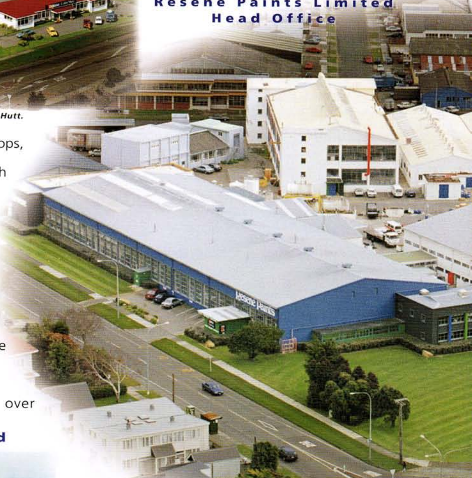
Resene Paints Limited Head Office and warehouse are situated in Naenae, Lower Hutt. Water-based products are also manufactured at this site.