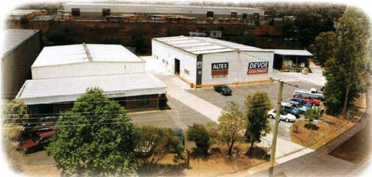
Resene Paints Australia Limited focuses on manufacturing marine coatings as well as a full range of industrial and architectural coatings from its factory on the Gold Coast.

and commercial buildings, marine, heavy industrial, road marking, automotive and agricultural use.