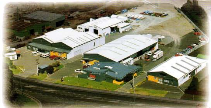
Altex Coatings Limited, with manufacturing facilities both in Tauranga and Australia, is New Zealand's largest privately-owned manufacturer of protective coatings for industrial and marine surfaces. Altex Coatings also manufactures the 'AWLCRAFT' range of pleasure marine coatings.