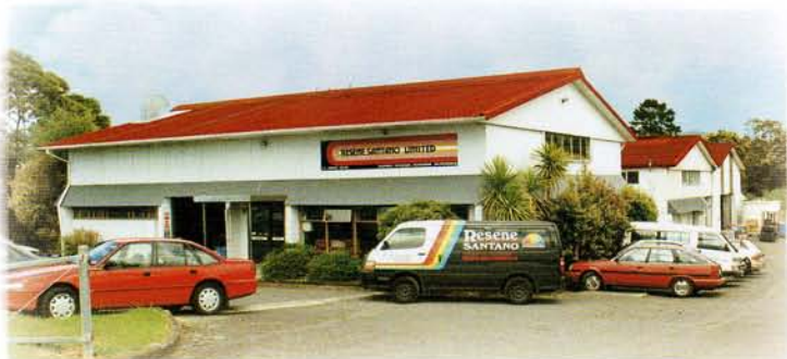
Resene Santano Limited, located in Henderson, Auckland, manufactures its own brand of automotive, furniture and industrial paints and a range of car care products for the New Zealand market. Resene Santano is also the distributor in New Zealand for the world's leading brand in automotive refinish paint - DuPont car paints.

the intervening years led to the need for increased factory space. In 1962, the company moved premises from Kaiwharawhara, in Wellington, to Seaview where the company remained for 30 years before moving to