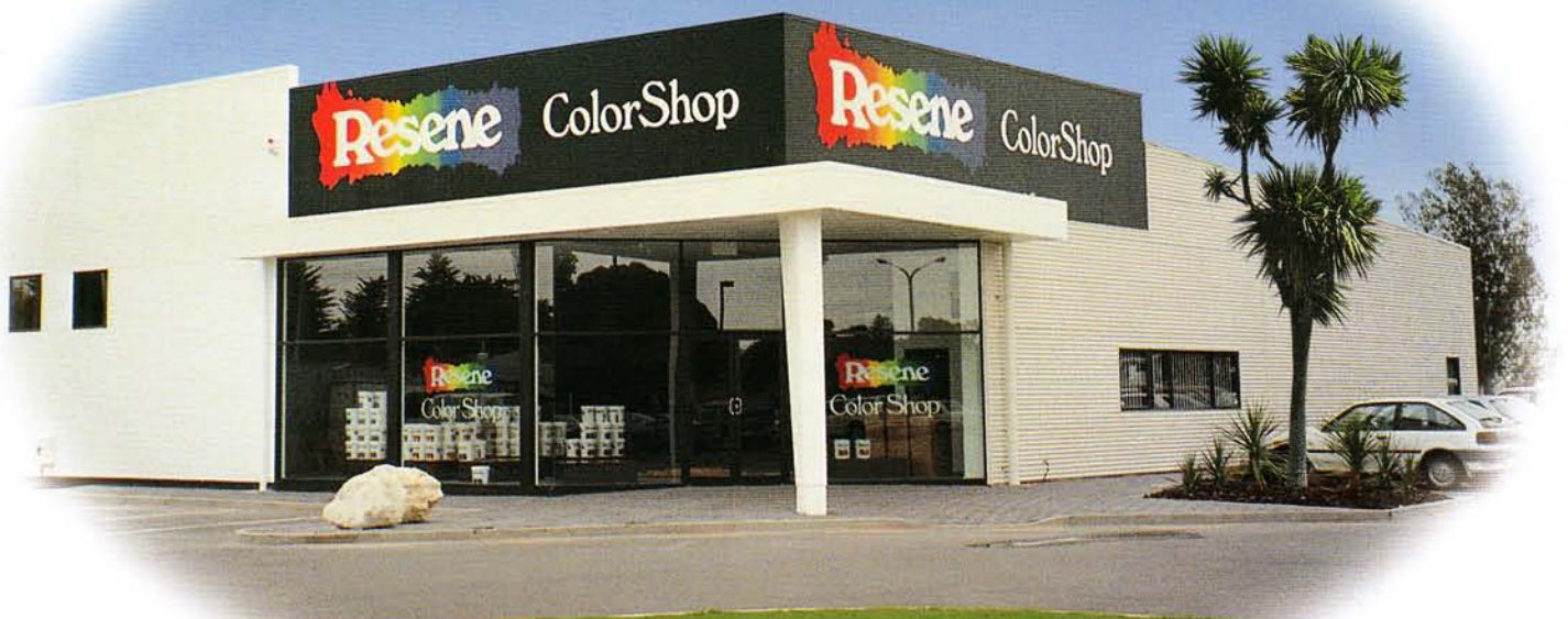
The new Resene ColorShop on Taradale Road in Napier.