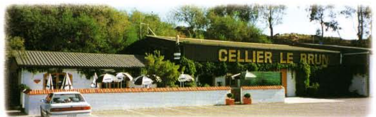
Cellier Le Brun Ltd, located in Marlborough, has earned its place as one of the country's leading wineries on the strength of its Cellier Le Brun range of Methode Traditionnelle wines. A Pinot Noir, Sauvignon Blanc, Chardonnay and Classic Brut are also marketed under the Terrace Road label.