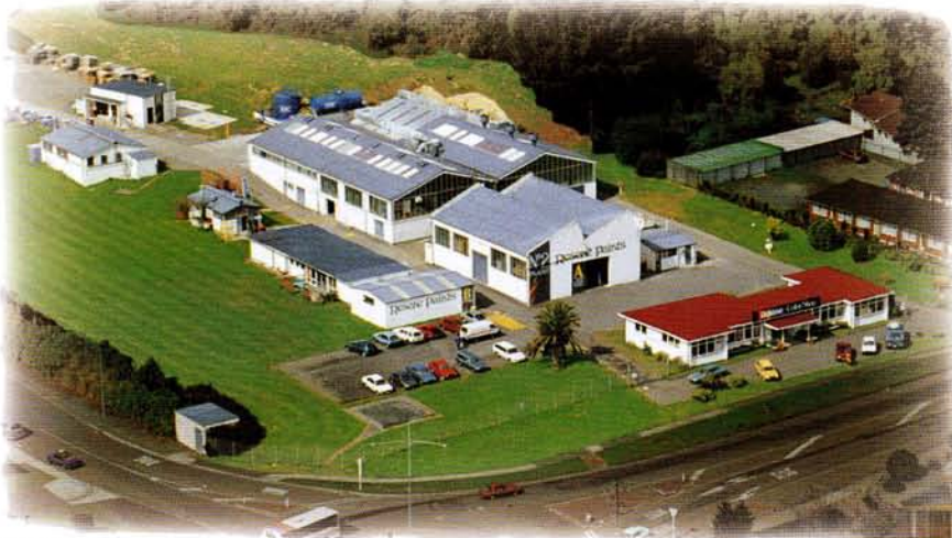
Resene Paints solvent-based products factory is located in Upper Hutt.

Resene Paints has 50 company-owned ColorShops, and 22 franchisee outlets around the country with around 500 staff in New Zealand.