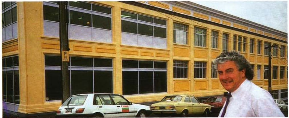
Al Hitchens and newly-painted media HQ

The Sun is the just-launched new Auckland morning newspaper.