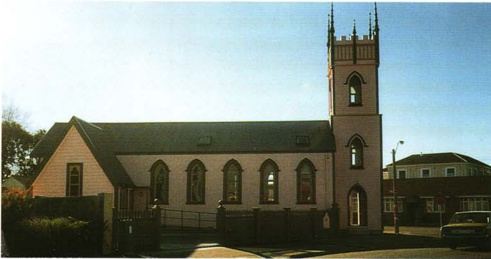
The refurbished St Mark's Anglican Church now the Headquarters of Norwell & Reilly, Architects and Consulting Engineers.