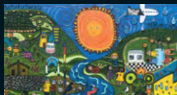
2019 Best School Year 1-6 Winner: Manuvera School

Open to murals in Australia, New Zealand and the Pacific Islands.