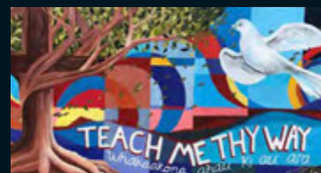
2019 Best School Year 7+ Winner: Hamilton Christian School