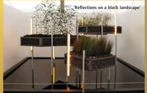
'Reflections on a black landscape'