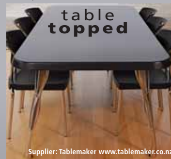
Supplier: Tablemaker www.tablemaker.co.nz

And if coloured tabletops don't light your fire, you can always opt for customised table legs and a timber, plywood, concrete, Perspex or glass top. With your choice of leg, top, size and colour, your next table can be anything you want it to be.