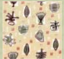
2B Resene Winter Hazel, Hint of Grey, Napa, Sage, Tamarillo, Sambuca