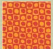
3B Resene Fire, Fuel Yellow