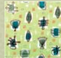
2A Resene Wild Willow, Hint of Grey, Juniper, Sage, Fire, Sambuca