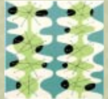
1B Resene Hint of Grey, Juniper, Wild Willow, Sambuca