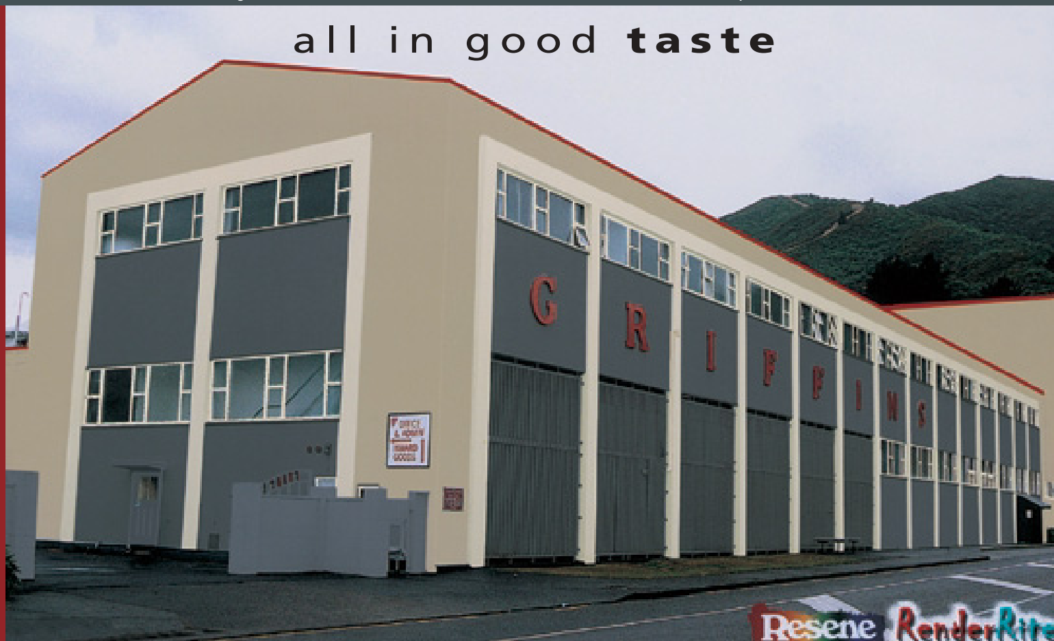
Visualising the finish with Resene RenderRite.

Visualising the final colour scheme on a specific building is a difficult task for even the most talented design professional, let alone for those focussing on a wide range of non colour design tasks. Even more difficult is selecting the right colour scheme from alternatives without a link back to the actual building being coated.