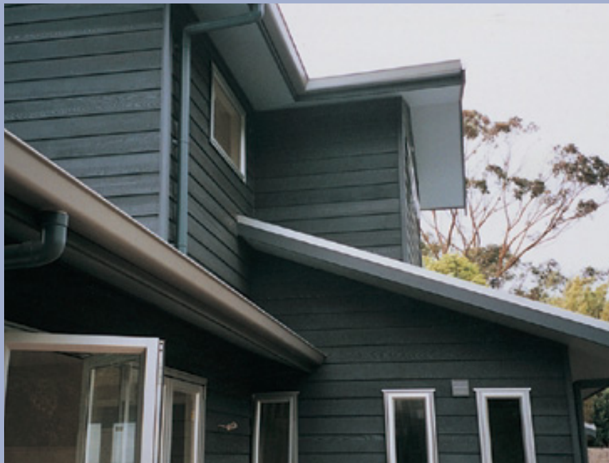
▲ The finished result on an Auckland residential dwelling.

For further information on Machinecoat see the Hermpac website www.herpac.co.nz