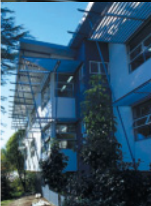
Resitex Medium adds textural interest.

A new building at Nelson Girls College, Trafalgar Street South, Nelson, has been treated to a new specialist finish – Resene Resitex Medium – to provide textural interest and relief. Evidence of the successful combination of new building and textured coating includes the short listing of the project in local architecture awards. The exterior colour scheme consists of Resene 'Scotch Mist', while the interior has been finished in a palette of 'Persian Plum', 'St Tropaz', 'Grape', and 'Putty' over titan board panels.