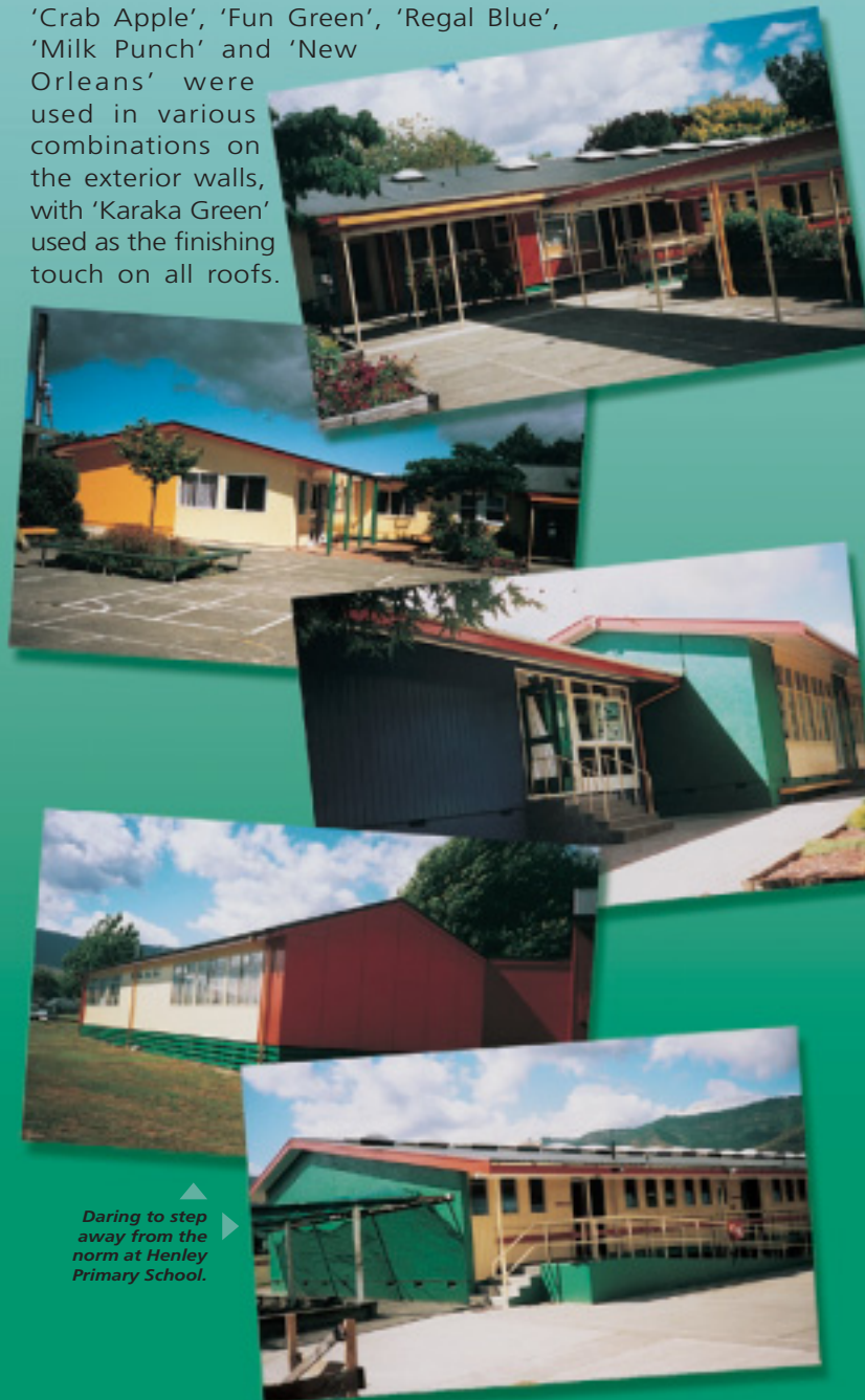
Daring to step away from the norm at Henley Primary School.