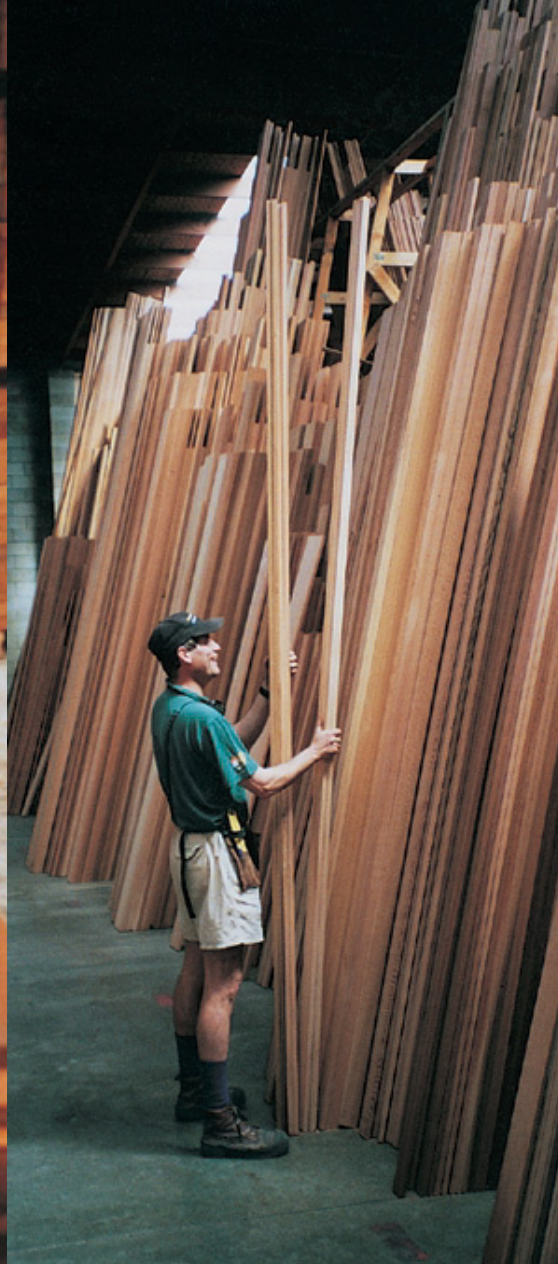
▲ Natural cedar in storage in the Herman Pacific warehouse.