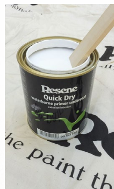
Step 4 Carefully stir the Resene Quick Dry.