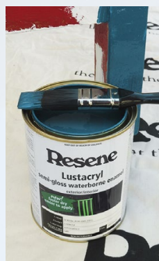
Step 7 Apply one coat of Resene Lustacryl tinted to Resene St Kilda to the chair and allow to dry.