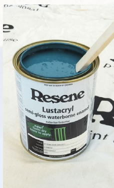
Step 6 Carefully stir the Resene Lustacryl tinted to Resene St Kilda.