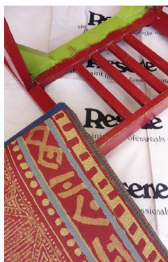
Step 1 Carefully remove the upholstered seat and back.