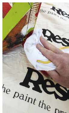
Step 3 Wipe off any sanding residue with a clean cloth.