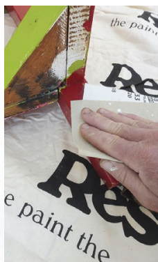
Step 2 Lightly sand the chair to 'key' the surface.