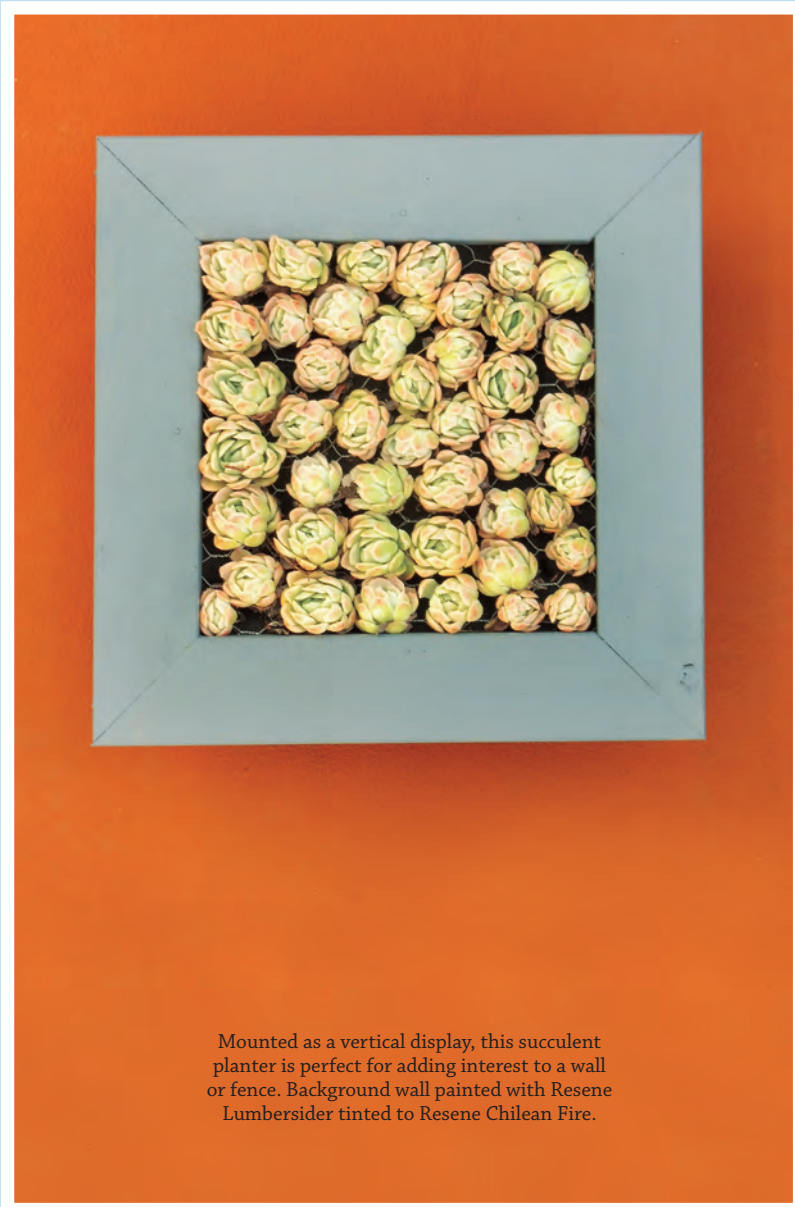
Mounted as a vertical display, this succulent planter is perfect for adding interest to a wall or fence. Background wall painted with Resene Lumbersider tinted to Resene Chilean Fire.