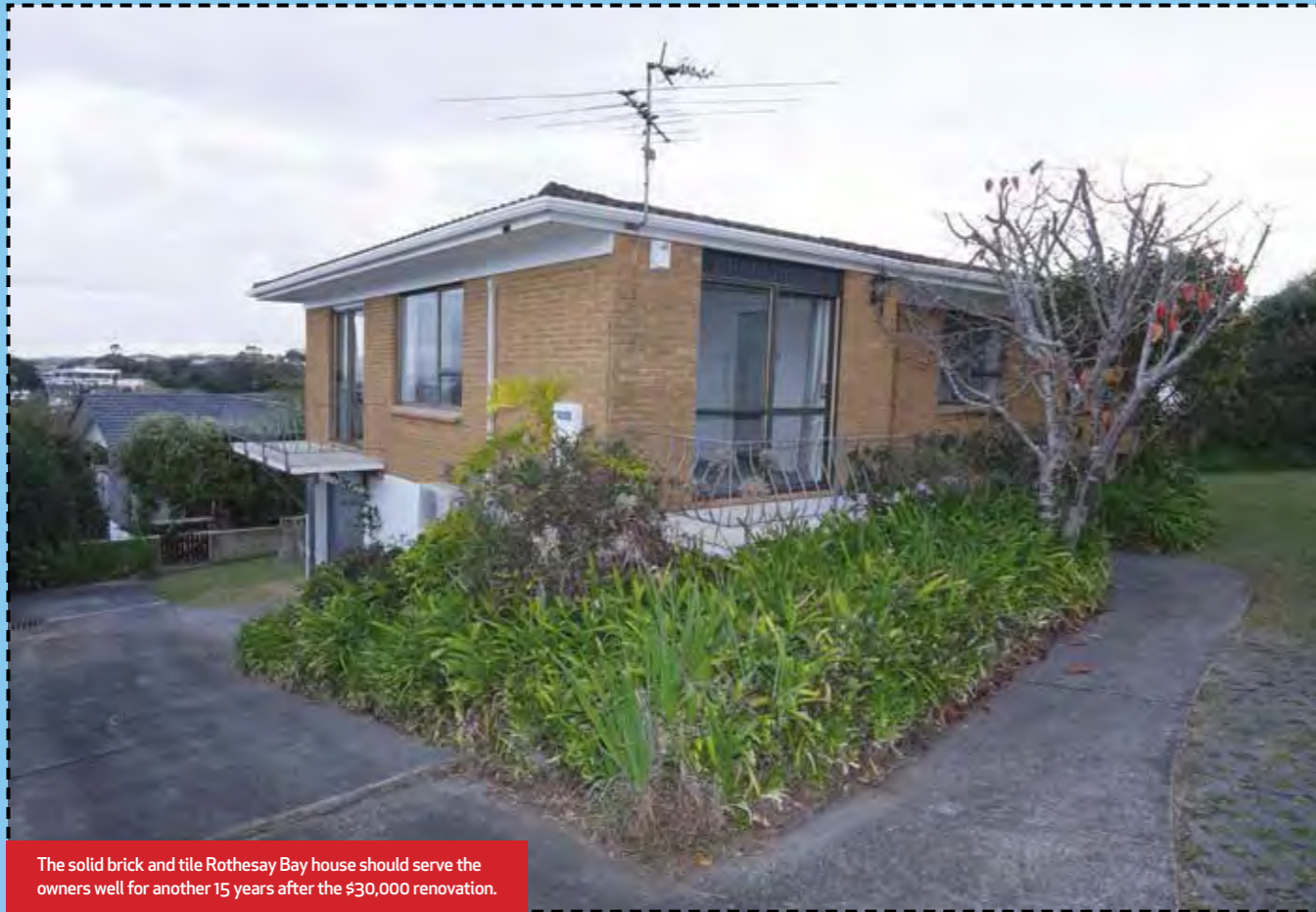
The solid brick and tile Rothesay Bay house should serve the owners well for another 15 years after the $30,000 renovation.