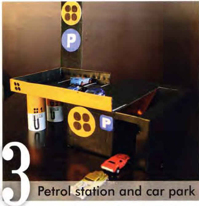
3 Petrol station and car park

Here's one for the engine aficionados in your household. A touch of black paint can quickly transform a basic box into a car park. The top level is the shoe box lid, glued on at right angles to the upturned box - which becomes the lower level. Cut a slit in the top of the box for the ramp, and an entrance way of the same width in the side. The supports are toilet rolls painted to look like petrol pumps. Draw white lines for parking spaces.