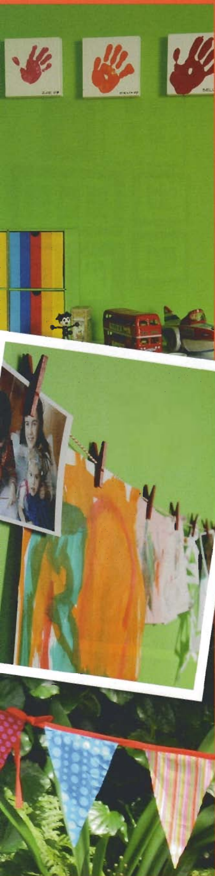
Above: Handprints, Kids artwork and bunting. Opposite page - clockwise from top left: Letters, bunting, painting old furniture and framing kids artwork.