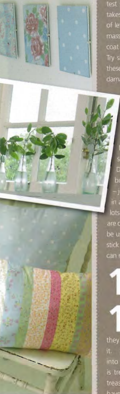
Above: Fabric pictures, flowers and plants, and cushions.

12 Letters These can come in all shapes and sizes, and in past issues we have talked about painting them straight on to the wall with the help of an overhead projector and a RESENE test pot. This is about as cheap as you can get. It just takes a bit of time. Lots of companies now have a range of letters – from expensive single letters through to small mass-produced ones; these always benefit from a bright coat of paint. Try Ezibuy, Spotlight, and the Warehouse. Try sign writing companies for single polystyrene letters – these are safer than the wooden ones and would do less damage if they fall on a small person! They are perfect when you want to inject a bit of colour and fun to a neutral room.