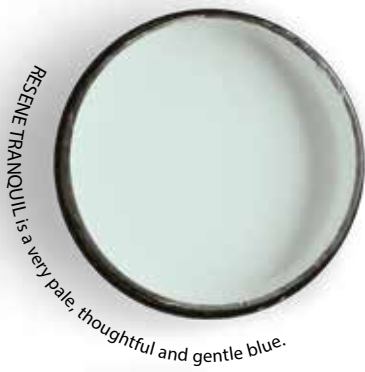
RESENE TRANQUIL is a very pale, thoughtful and gentle blue.