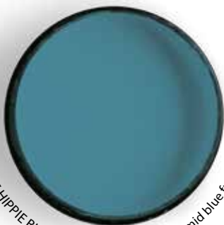
RESENE HIPPIE BLUE is a playful and amusing mid blue from the 1960s.