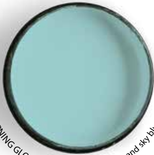
RESENE MORNING GLORY is a watery blend of sea and sky blue.