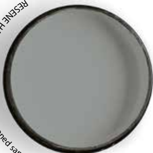
RESENE HALF STACK is a simple mid-toned sandy grey, stony and dry.