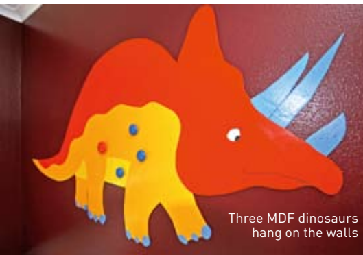
Three MDF dinosaurs hang on the walls

DESIGN FEATURES Splat + Tory Blue (medium blue); Tory Blue (darker blue); Lickety Split (pale green); Dizzy Lizzy (lime green); Grass Stain (darker green); Fizz (yellow); Frenzee (orange); Get Reddy (red); So Cool (metallic silver)