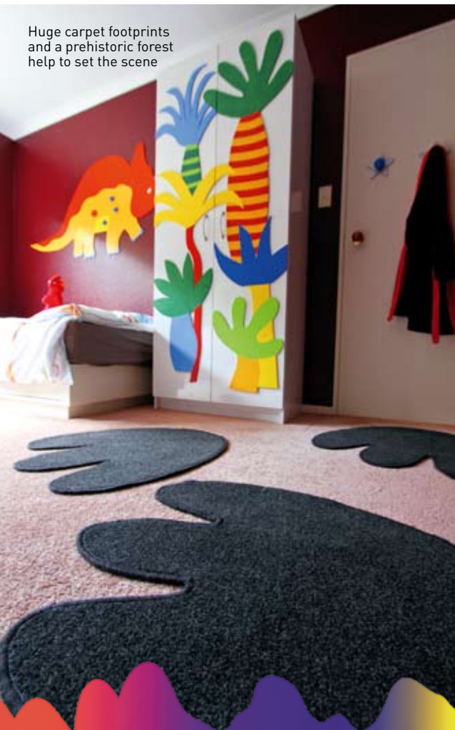
Huge carpet footprints and a prehistoric forest help to set the scene