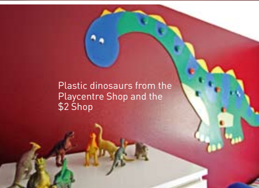
Plastic dinosaurs from the Playcentre Shop and the $2 Shop