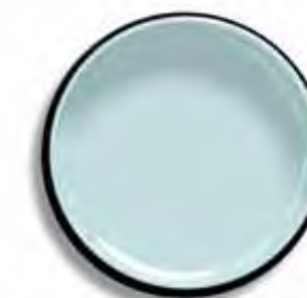
Resene Cut Glass