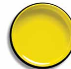
Resene Bright Lights