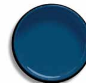
Resene Bellbottom Blue