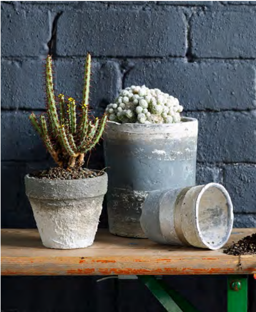
ABOVE LEFT TO RIGHT Textured pot with bottom painted in Resene Resitex in white, with a colour-washed top in Resene Pure Pewter metallic then covered with a Resene Crackle Effect, using a wash of Resene SpaceCote over the top. Middle pot has a stripe painted in Resene Stack, then sanded. Pot on its side has painted stripes in Resene's metallic Silver Aluminium and Proton, with a base of Resene Stack.