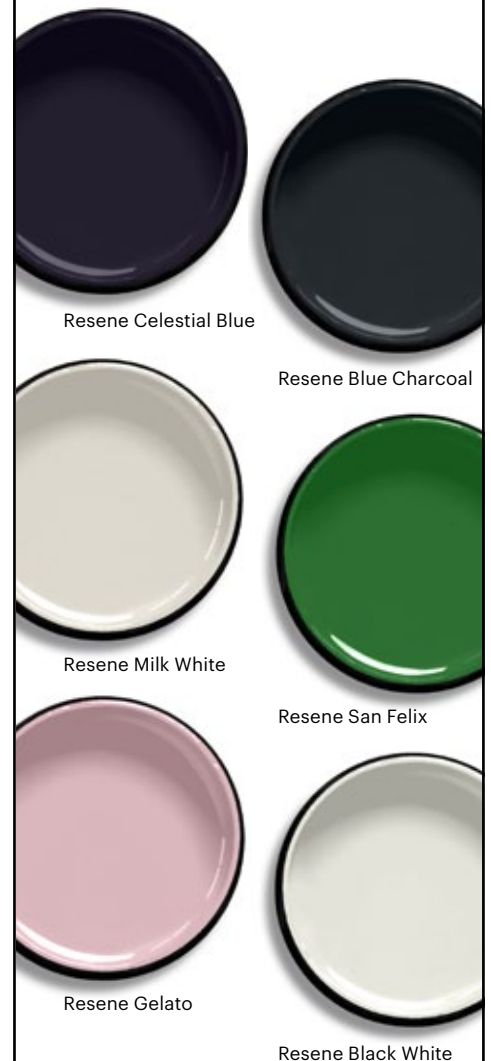
Resene Celestial Blue

The all-important colour choice – it can be an overwhelming process, but here are a few tips to help. Firstly, I began with an inspiration point. This can really be anything – a piece of fabric, the change of season or a current colour crush. The next step is to keep in mind where the artwork will hang. Maybe you're working with neutrals for the lounge, perhaps an eye-catching entrance – or maybe you want something bright and bold for the kids' room. Wherever it may be, think of the surroundings and the feeling you want it to portray. I was influenced by an artwork, and wanted to create something with a sense of ease and serenity for our bedroom. So I chose cooler colours, keeping it to a moody blue, a hint of fresh green, a soft pink and tying it together with a milk white. For more ideas and inspiration see your Resene ColorShop or reseller, resene.co.nz/colorshops or call 0800 RESENE (737 363).