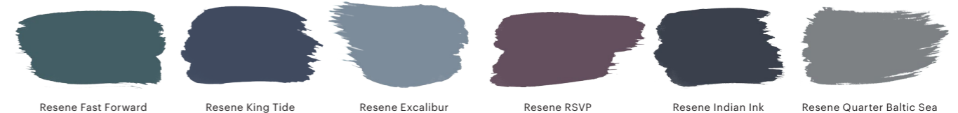
Resene Fast Forward