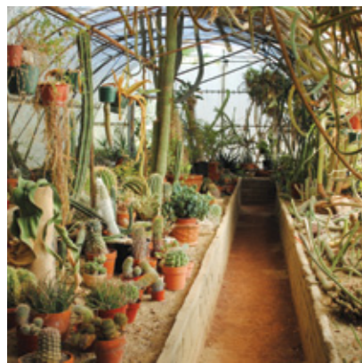
INSPIRATION California cactus garden.

STYLING Juliette Wanty PHOTOGRAPHY Wendy Fenwick