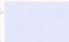
Hawkes Blue 7B10