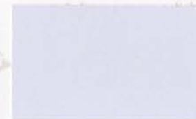
Link Water 7B60