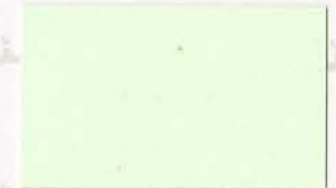
Snowy Mint 7YG30