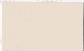
Spanish White 8YO25