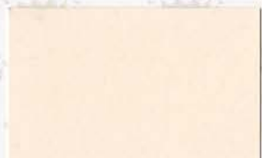
Dutch White 7YO37