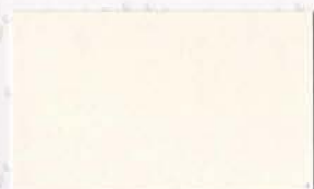
Whipped Cream 8.5YO19