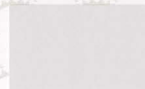
Grey Nurse 7GR10