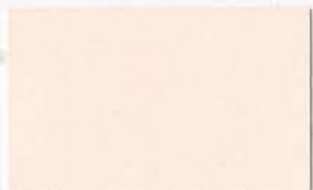
Egg Sour 7YO50