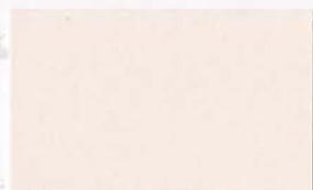
Half Spanish White 9YO25