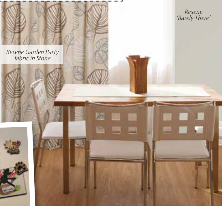
Resene Garden Party fabric in Stone