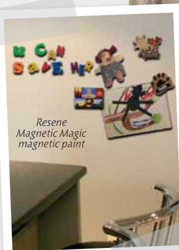
Resene Magnetic Magic magnetic paint

And then there's the fun stuff. Resene Blackboard Paint, Resene Magnetic Magic paint can be used to create a magnetic wall area so you can hang photos and notices and even Resene Write-on Wall Paint, a clear whiteboard style finish that you can apply over your existing paintwork to turn it into a coloured whiteboard.