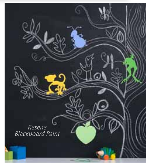
Resene Blackboard Paint