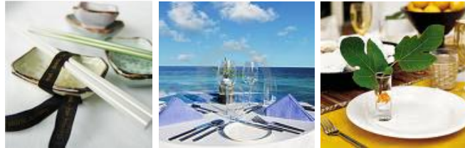
Table settings and dining furniture are carefully selected to ensure they provide long term service as well as add to the design. Chairs need to be sturdy, lightweight and easy to move, tables easy to wipe down after spills.

Cabling and ducting is usually concealed within the suspended ceiling space or sometimes a cavity is created under an access flooring system. Cables may also be ducted along skirting boards and incorporated within cabinetry.