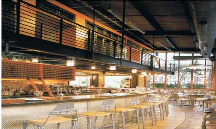
This is an example of an industrial styled bar in an old warehouse.

Cafes are operating within book stores, fashion boutiques, beauty salons and sports stores. And every shopping mall has an extensive food hall within it. Dining spaces are popping up everywhere, even among factories in industrial areas.