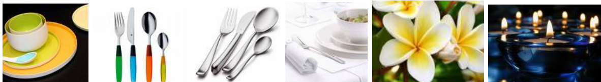
Table settings make all the difference to bring people together to share a meal. Cutlery should be substantial and well balanced, glasses should be clear and appropriate for the drink taken from them. Plates should be generous in size but never overfilled. Flowers, living plants and herbs, water and candles add to the sensual dining experience.

The sensual approach to food is to eat well and enjoy, eat when you are hungry and eat the things you love, plus one or two new things for a bit of adventure. The natural flavours and fragrances of fresh food nourish the body and soul.