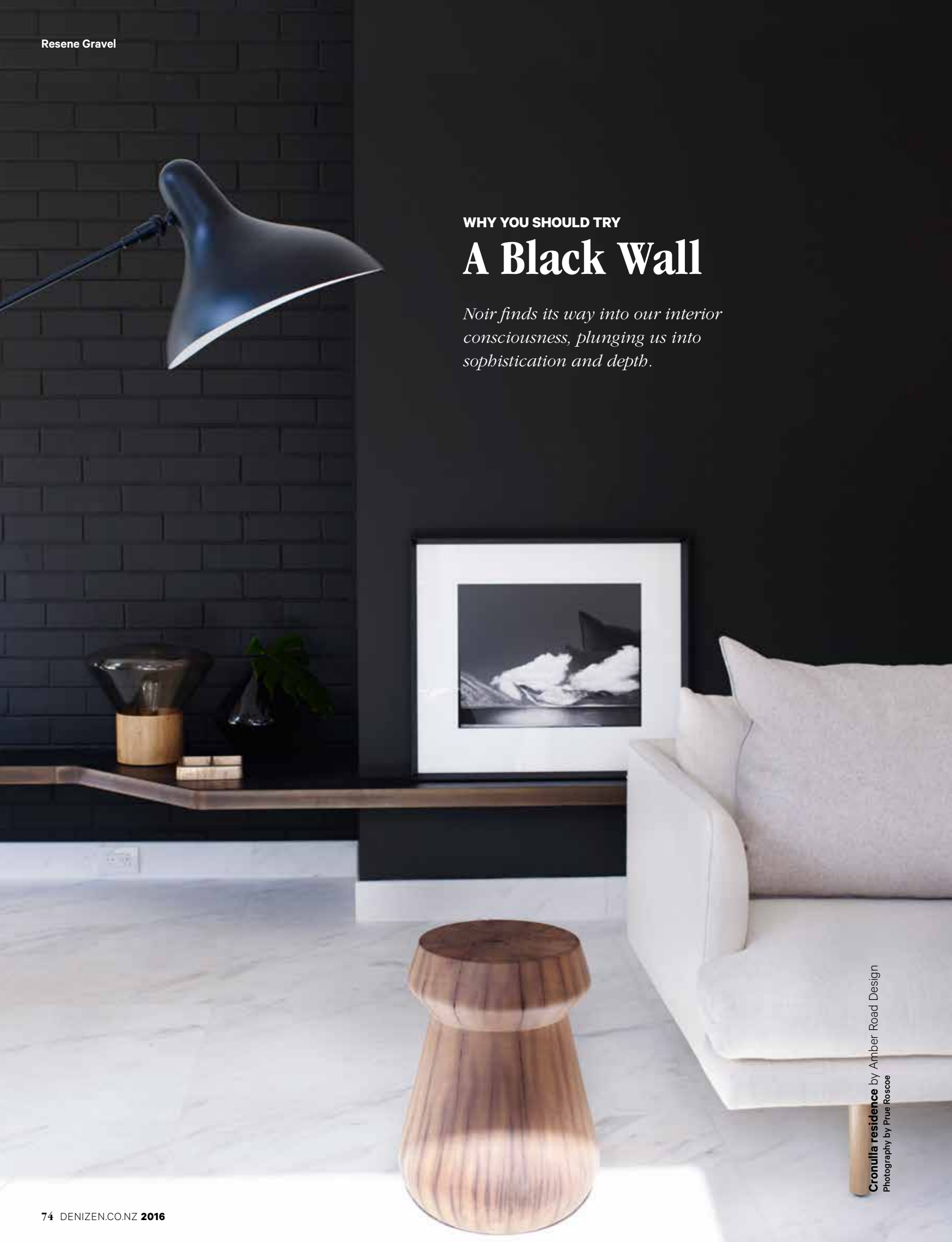
Cronulla residence by Amber Road Design

Noir finds its way into our interior consciousness, plunging us into sophistication and depth.