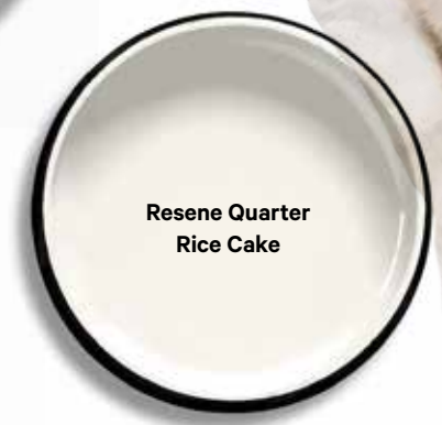
Resene Quarter Rice Cake