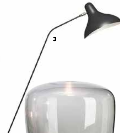
3. Mantis floor lamp by Bernard Schottlander from Backhouse