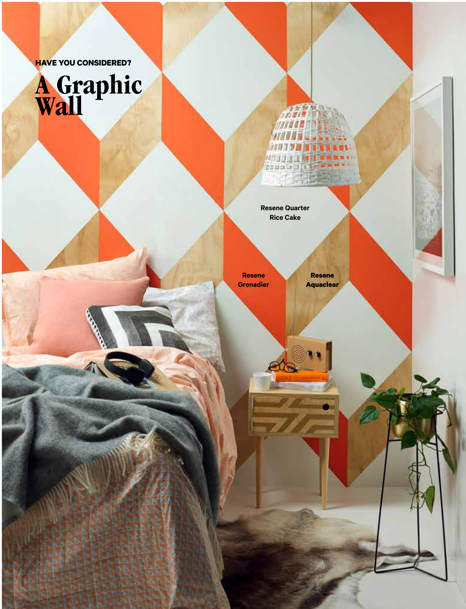
Resene Quarter Rice Cake