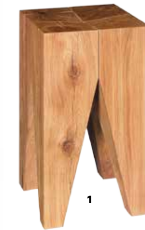
1. Backenzahn stool by e15 from Simon James design

When assessing whether to paint a wall black, firstly consider whether there is enough natural light and that the ceilings are sufficiently high. Forgo the ceiling, instead leaving it a bright, light colour so as not to feel boxed-in. Resene's Gravel is particularly good for offsetting lighter pieces of art, bright furnishings and objets d'art. Enhance the space with plenty of lighting to ensure it remains inviting. When paired with natural wood finishes and pale floors, the overall effect can well be one of sophistication and depth. And if a commitment to all-black proves too daunting, a charcoal feature wall is a great way to dip one's foot in the ink well.