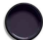
Resene Mine Shaft