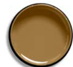
Resene Gold Dust