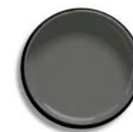
Resene Double Trojan