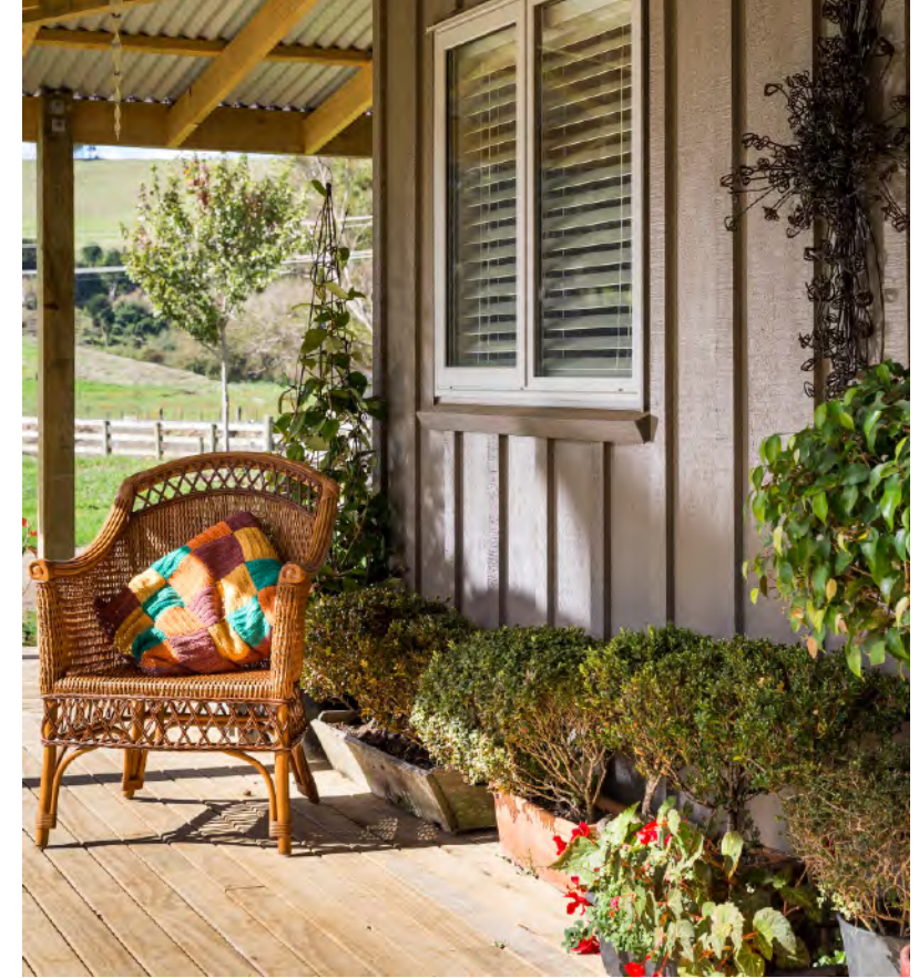
Opposite page: The large open plan kitchen and living featuring soaring timber sarked ceiling with exposed portal. Clockwise from top: House rules do apply... and this highlighted feature in the living area uses Resene Flashback; A cosy comfortable place to view the land; Behind the red door is a home with a definite 'wow' factor; The upstairs master bedroom, featuring dramatic ceiling lines; Noeline's house continues the trend of old world charm with raking sarked ceilings.